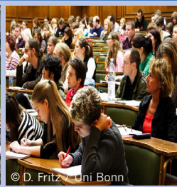
© D. Fritz / Uni Bonn